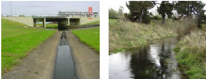
Figure 1: Highly impacted stream vs rural stream

Human activity has had profound effects in rivers and streams worldwide, with many streams being impacted by multiple physical (e.g. channel straightening), chemical (contamination by organic and inorganic pollutants) and biological (e.g. introduction of invasive species) stresses. Our research, on the bacterial community composition within stream biofilms has shown that the bacterial communities within urban streams (figure 1 left) appear, overall, to be quite different to those within rural streams (figure 1 right). This indicates that the bacterial communities within stream biofilms are strongly influenced by the nature of the surrounding catchment. The response of natural bacterial communities to various anthropogenic stresses may have important implications for the many ecosystem services that they provide, such as the cycling of nitrogen and organic matter and the detoxification of contaminants.