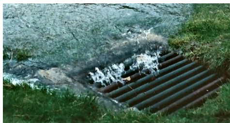
Figure 4: stormwater drain

Urbanisation is known to have considerably increased pollutant concentrations in surface waters. Metals are among the most common contaminants in stormwater and they frequently constitute a threat to our aquatic ecosystems. So far, research has focused on the effects of metals on aquatic macro-organisms, especially fish and benthic invertebrates, but little is known about their effects on stream micro-organisms. Recently our experiments have shown that dissolved metals influence bacterial communities and accumulate quickly in biofilms.