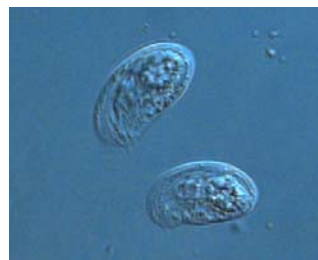
Figure 5: A pair of ciliate protozoa

In addition to our evaluation of bacterial populations, we have conducted similar studies which reveal populations of protozoa to be similarly affected by catchment development, typified by a reduction in diversity and significantly different community composition within urban streams.